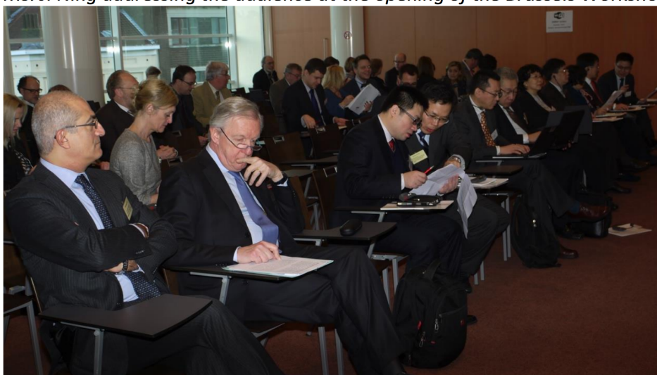
Brussels Workshop – View of delegates during plenary session