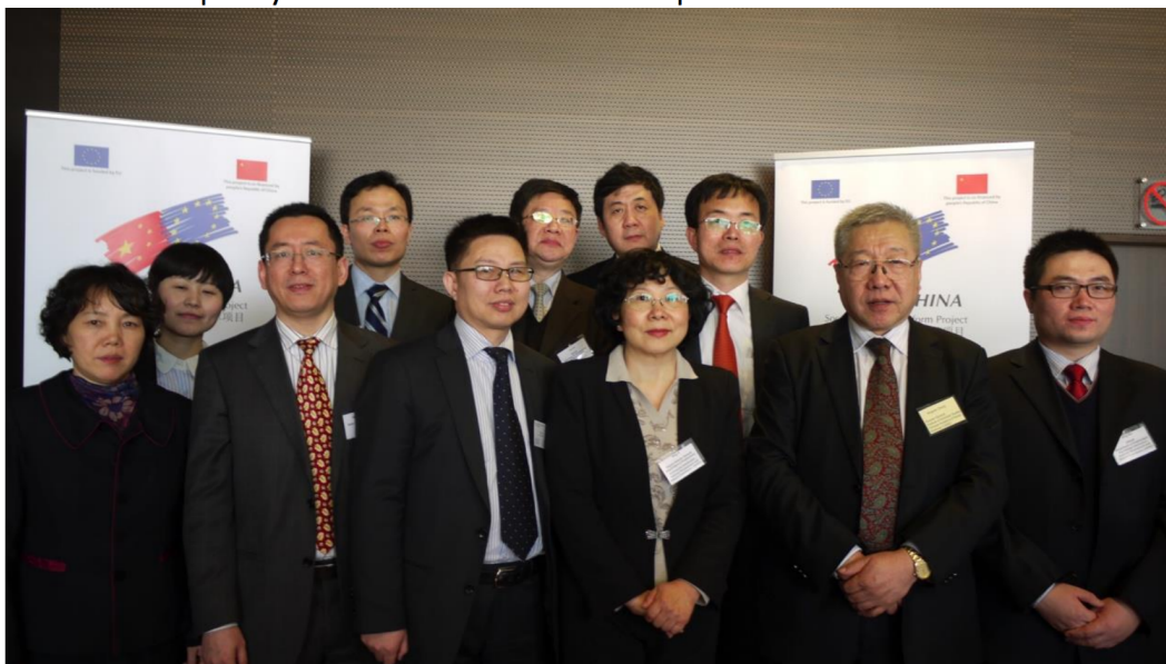
The Chinese delegation at the Brussels Workshop

international reports. The input from non-Consortium member states and representatives from international organizations was particularly appreciated. The perfect organization and the kind hospitality of its Belgian hosts furthermore added to the quality and success of the Workshop.