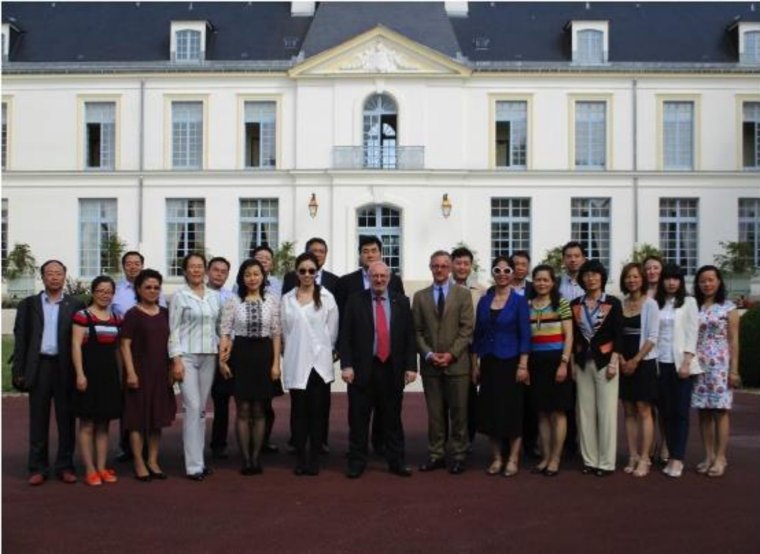
Group picture in front of the MGEN training center