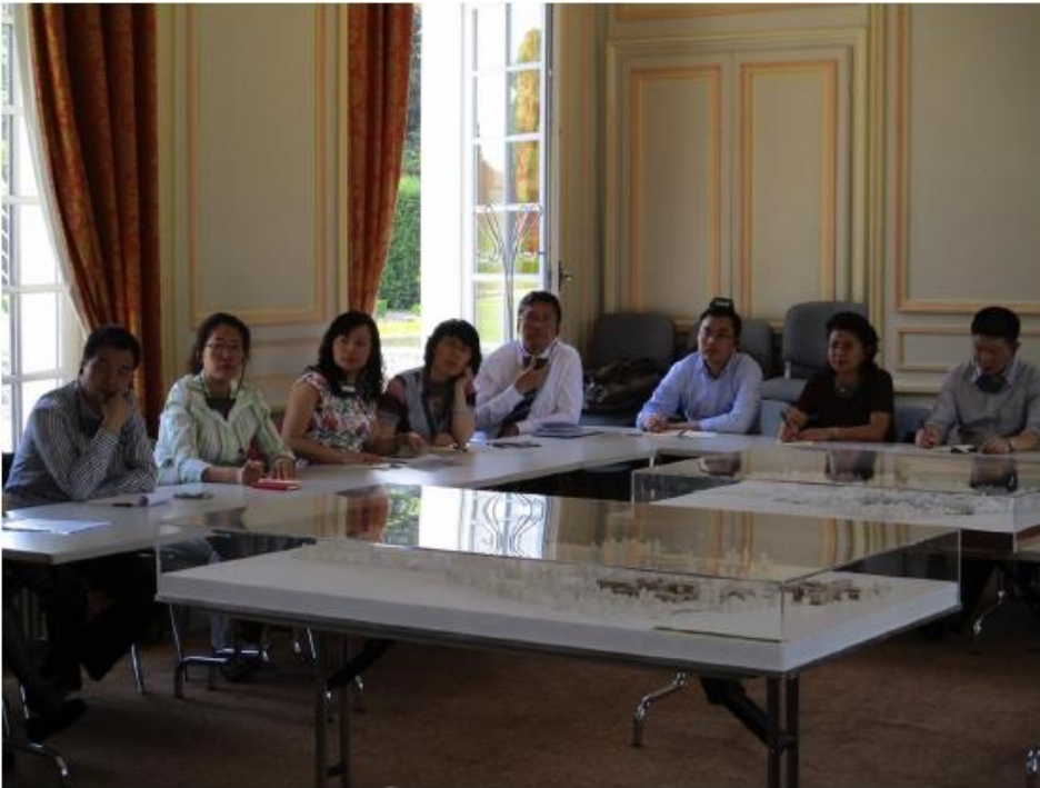
One small group training session

The good organization of the training event, the variety of the topics covered, the high professionalism of the lecturers and the quality of training materials produced were highly appreciated by the participants, who confirmed this exercise would be of great practical value for their work in support of the Chinese social security reform at the central level, or at that of Provincial governments of China. It was noted that this training came at a crucial moment, when critical decisions were in the making concerning the future design of the Chinese pension system. The contribution of the project to enhance the level of understanding of key NDRC officials in European pension theory and practices was therefore highly relevant and deeply appreciated.