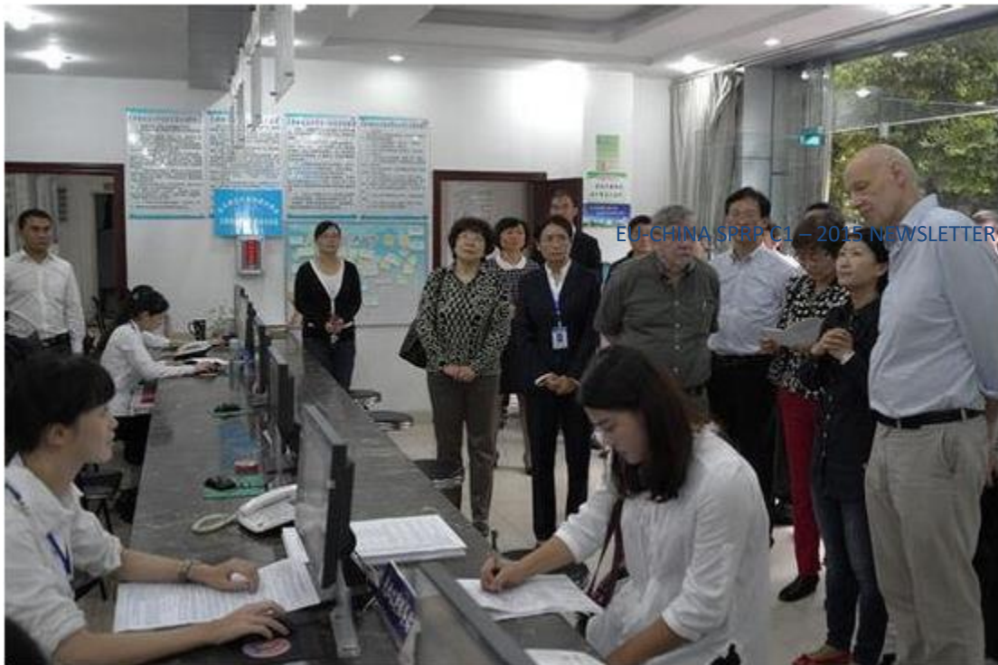
Visiting Social security community center, Luzhou City