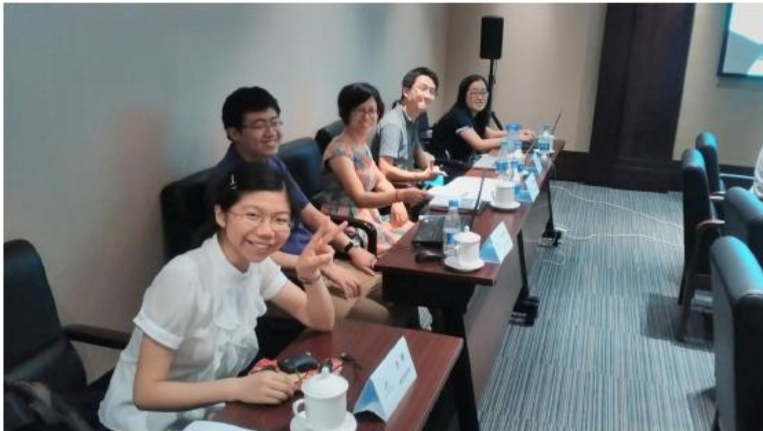
The bench of the assistants ...