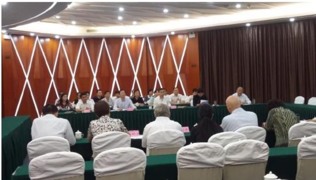
Meeting with City Government officials

Detailed documents expressing the respective provincial fields of interest were subsequently sent to NDRC and shared with the C1 team. Basically, the Provinces request exposure from the project on General introduction to social security policy in the EU, Monitoring and operational systems, Building IT systems for social security and fund raising, Vesting and portability of social security rights for migrant workers. They requested that knowledge sharing take the form of capacity building either in-country or abroad.