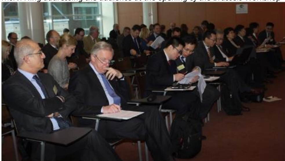
Brussels Workshop – View of delegates during plenary session