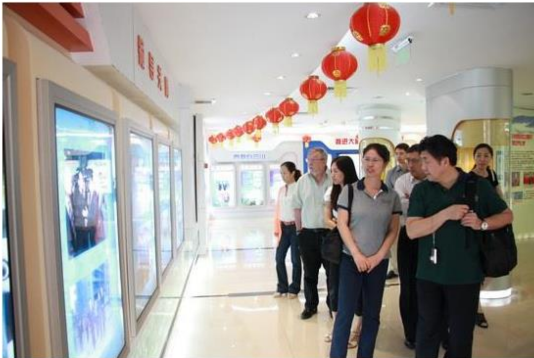
Visiting pharmaceutical company in Huizhou

Not to delay implementation of cooperative activities with the Pilot sites, it was decided by NDRC and the C1 team that the second Panel discussion, dealing inter alia with issues related to migrant workers' social security, would associate representatives from selected pilot sites in Guangdong and Sichuan provinces. It is foreseen that a further training will be provided in situ in February 2016.