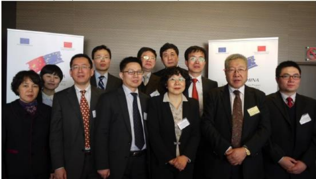
The Chinese delegation at the Brussels Workshop

international reports. The input from non-Consortium member states and representatives from international organizations was particularly appreciated. The perfect organization and the kind hospitality of its Belgian hosts furthermore added to the quality and success of the Workshop.